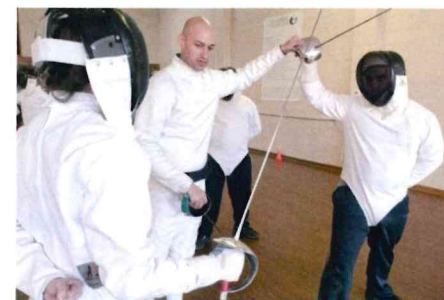
EN GARDE FENCING CLUB

One of the things I enjoy most is finding people that haven't been downtown in a while and updating them on what's new. When I tell them we've got The Corkscrew Winery, where you can bottle your own wine, or fencing lessons at En Garde Fencing Club (yes, that Olympic sport with swords), people don't believe me. I try to encourage folks to visit Ocala's Chocolate & Confections, where the owners make the chocolate, by hand, right before your eyes. I tell people it's possible to eat fondue at The Melting Pot, play pool at Downtown Billiards, or even get new kitchen counters at Homespace, all without walking more than 10 paces. Get a fitted men's suit at Greiner's, a piano at Parramore Music, a new road bike at Brick City Bicycles, or a corset at Jezebel's... the list goes on.