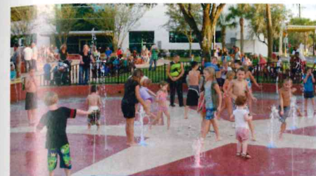
THE SPLASH PAD AT CITY HALL

Alas, here's my favorite. There is no other place to be with friends than downtown Ocala. Need to meet a co-worker after five for a drink? Find exceptional happy hour specials at places like Mark's Prime and Harry's Seafood, Bar & Grille. Looking for the best live music in town? Head upstairs to the rooftop at Pi on Broadway on any Friday or Saturday night where you shouldn't be disappointed by the music—or the view. Want to grab a beer with your buddy? You'll have the choice of 30-plus craft beers at downtown Ocala's newest local brewery, Infinite Ale Works. Maybe you're looking for something a little more chill. Sing karaoke at the Courtyard on Broadway or enjoy the back patio at O'Malley's Alley. If it's something more upscale you desire, then BG Downtown has regular martini specials and ladies night events. There is literally something for everyone.