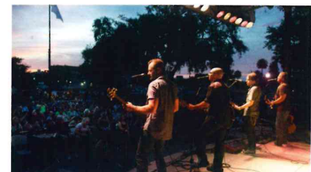
SISTER HAZEL PERFORMING LIVE